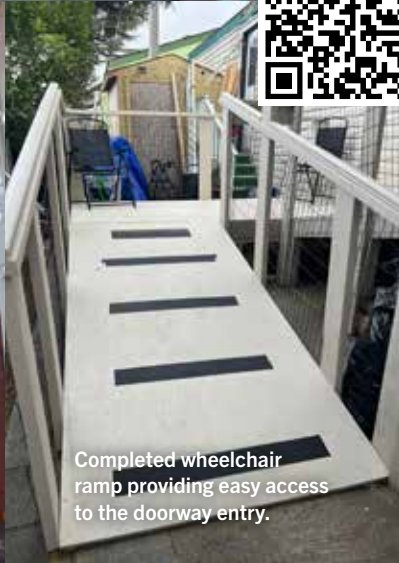
Completed wheelchair ramp providing easy access to the doorway entry.