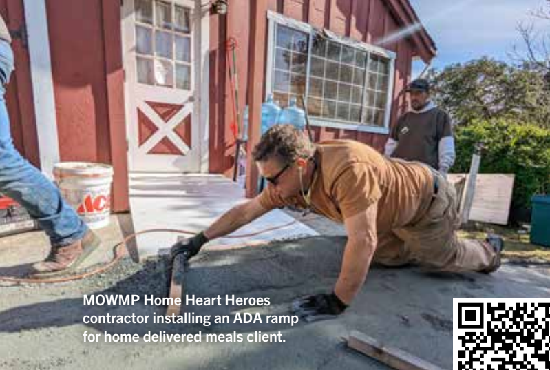
MOWMP Home Heart Heroes contractor installing an ADA ramp for home delivered meals client.