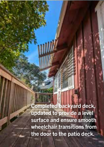
Completed backyard deck, updated to provide a level surface and ensure smooth wheelchair transitions from the door to the patio deck.